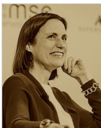
Fiona Hill (at MSC)