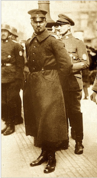
Naval Officer Hermann Erhardt

The name of Erhardt's militia organisation derives from the "Consuls" of the last Roman republic, an elite Roman political class with high powers who carried so-called "fasces" with them during public appearances, a strange bundle of wood wrapped around a long stick with a double-axed sword on top.