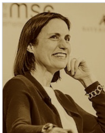
Fiona Hill (at MSC)